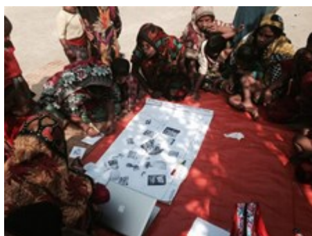
Focus group discussions on feeding practices, Enayetpur, Bangladesh,