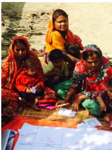
Discussions on feeding infant and young child feeding practices, Bangladesh,

The community believes that some risk factors are not being addressed through any programmes. For example, a major worry for the health of the community is that the increased use of pesticides, chemical fertilisers and formalin, which are recognised as being instrumental in increasing production, are detrimental to the quality of the food produced. This should not be overlooked and may sustain negative practices.